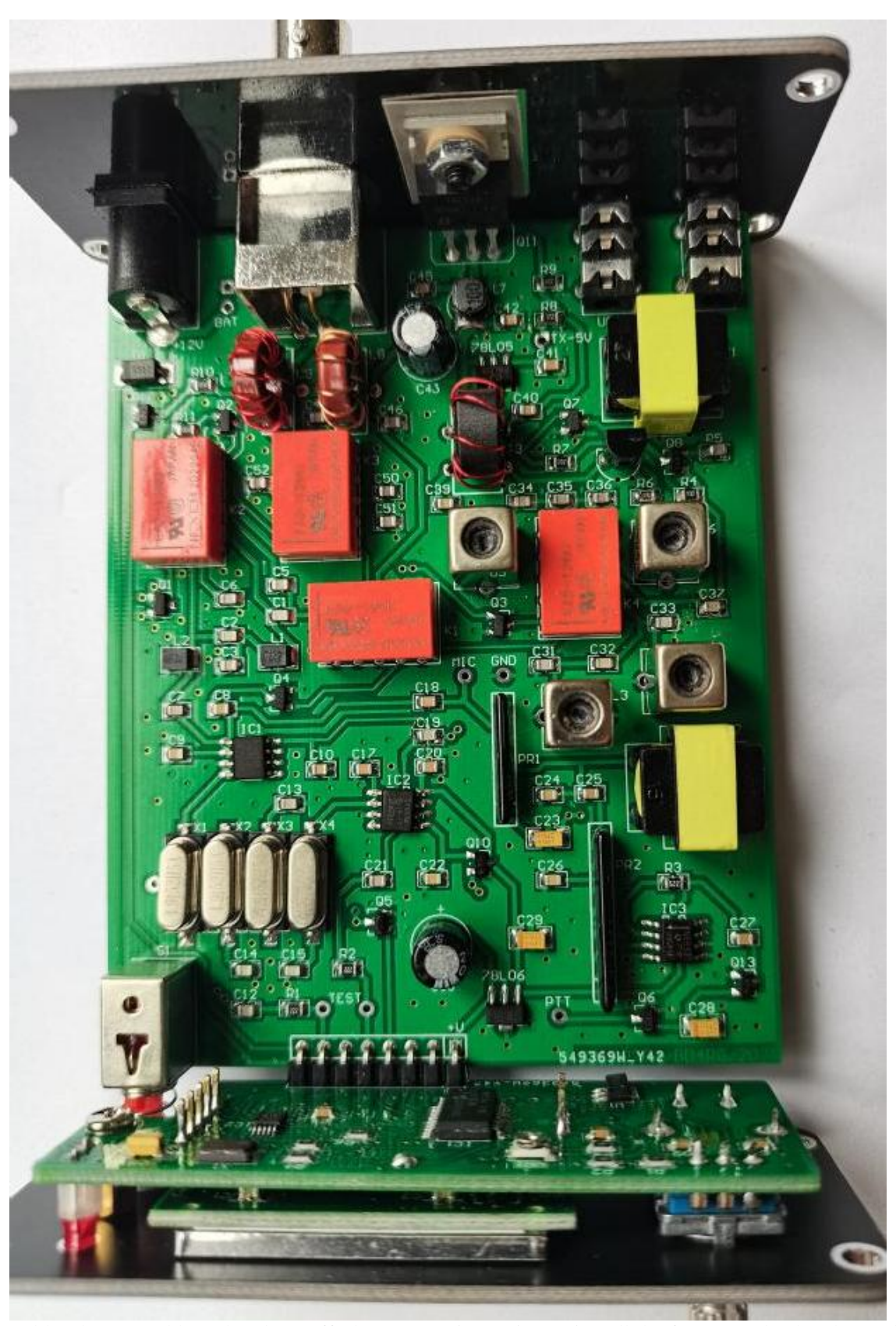
Solder the control board and cut off the excess pin section to install the front panel. The photo of the installed kit is as follows: